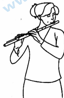
playing the flute