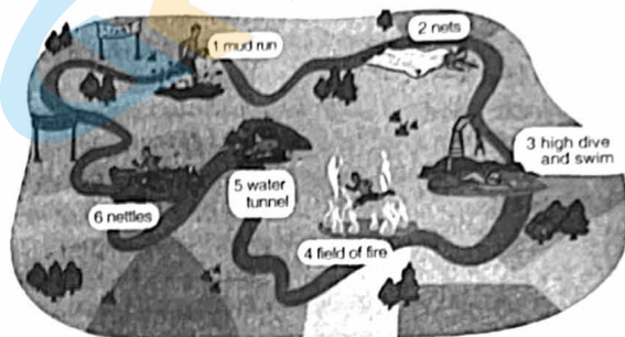
the diagram of the course

Every January, more than 3,000 people take part in one of the most difficult races on Earth: the Tough Guy competition. To finish the course, players need to run, swim and climb 15 kilometres. It is a special race because these runners have to crawl (爬)